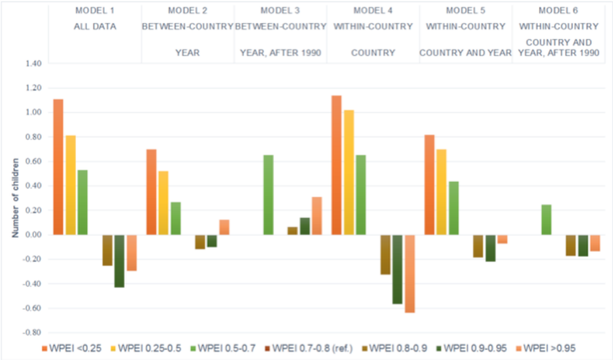
Figure 3: Relationship between gender equality (women’s political empowerment index, WPEI) and fertility in a succession of multivariate regression models

All models are based on country-years where TFR is regressed on WPEI. Models 4, 5, and 6 control for country characteristics, and therefore examine if changes in gender equality within a society are associated with fertility. Model 1, 2, 4, and 5 are based on data starting early (generally around 1960, occasionally back to 1900) and ending in 2017; models 3 and 6 are based on data for the period 1990-2017. Model 1 and 4 are without controls for changes over time, models 2, 3, 5, and 6 control for period changes. When not controlling for period changes the relationship between WPEI and TFR is always negative (model 1 and 4). The between-country models (2 & 3) show a U-shaped pattern between WPEI and TFR, consistent with previous theories and Figure 2. However, within-country models (5 and 6) show no such pattern.