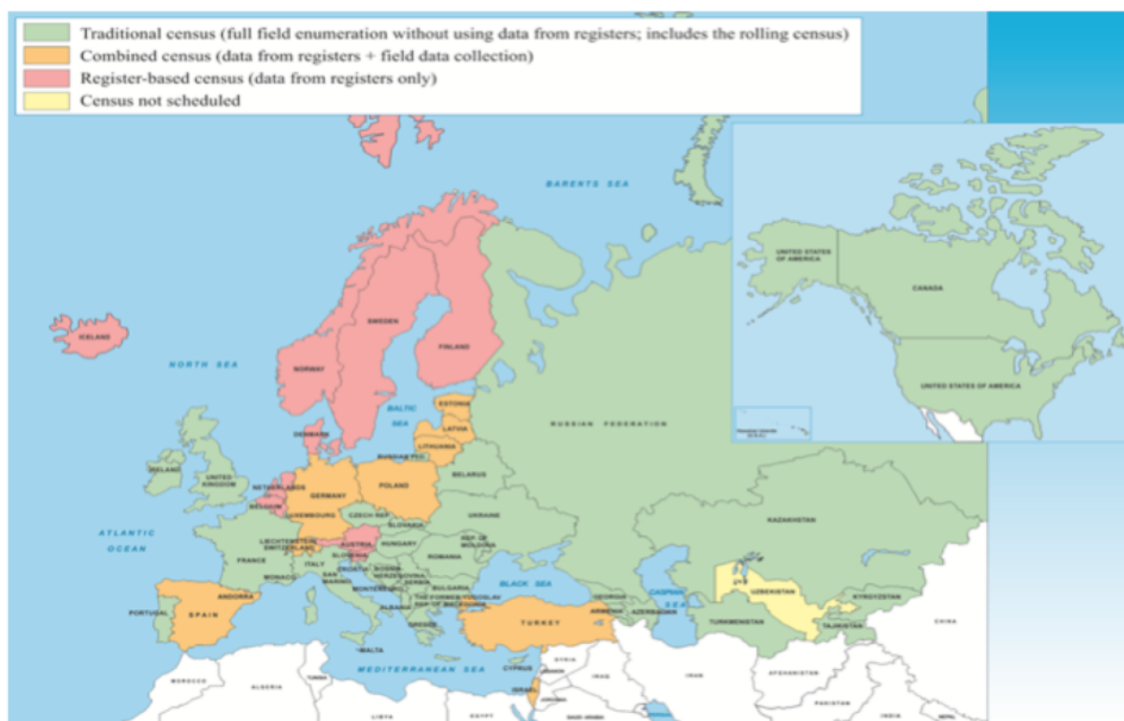
Figure 1: Census methods used by UNECE member countries in the 2010 census round.

Based on plans for the 2020 census round, the proportion of countries adopting an alternative method (register-based or combined census) will increase significantly from about one-quarter in the 2000 round to two-thirds (figure 2).