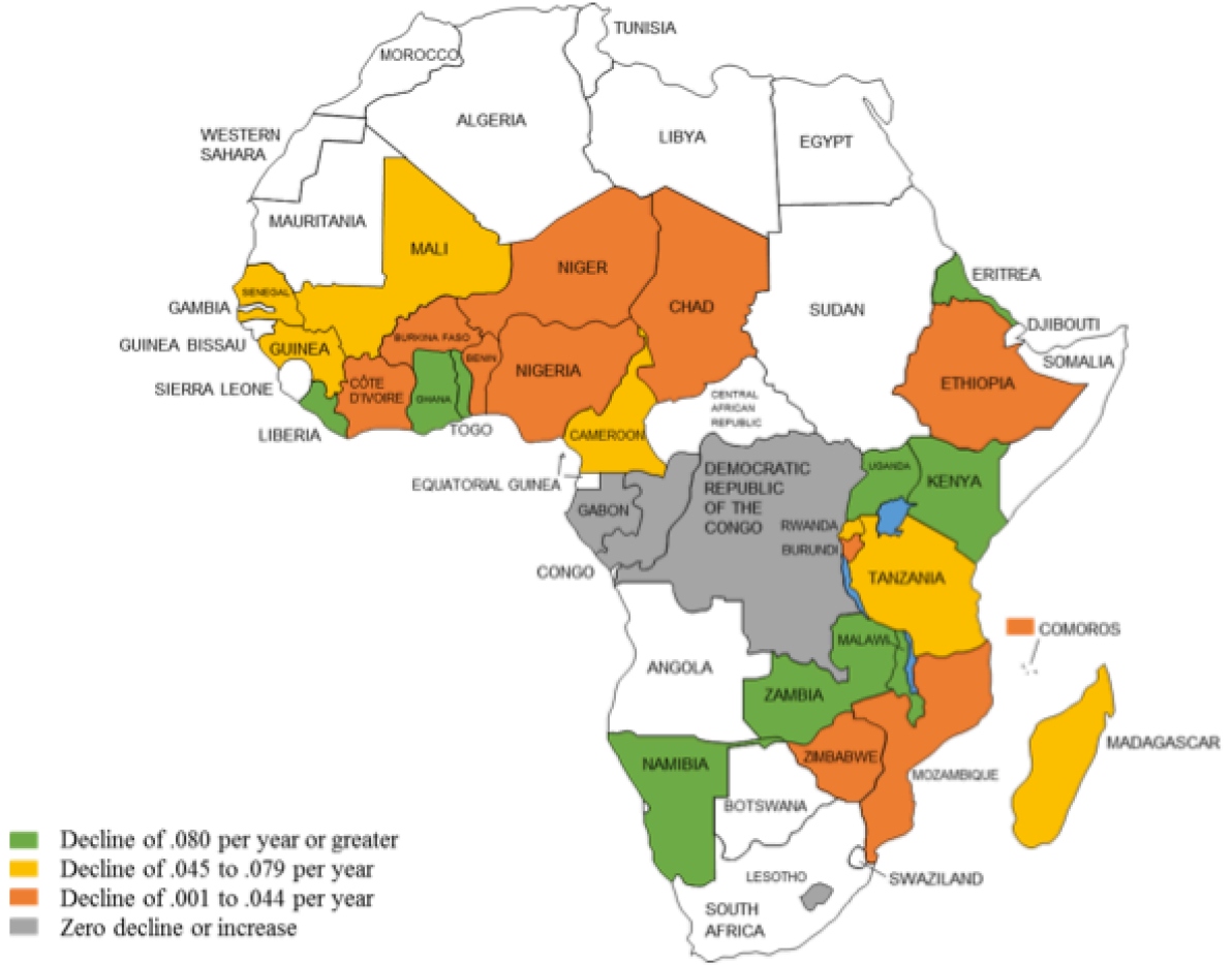
Map 1. Average Annual Pace of Decline in the TFR, Urban Places