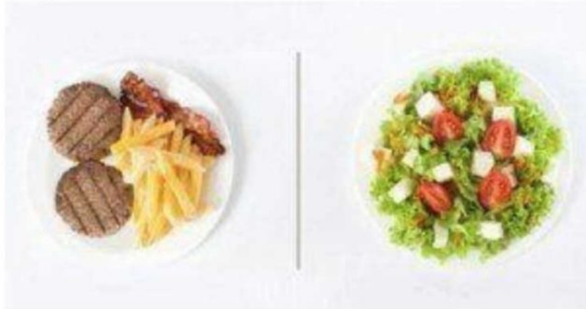
Figure 3: Two contrasting foods: processed meats and high fat/carbohydrates vs. vegetables and soybean